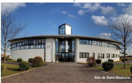
Site de Saint-Beauzire